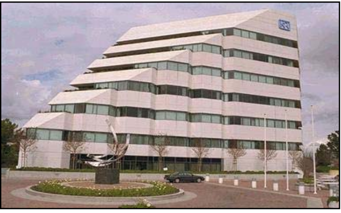
2440 El Camino Real, Mountain View

EHealthInsurance Services signed a short one year renewal for their space at 440 Middlefield Road