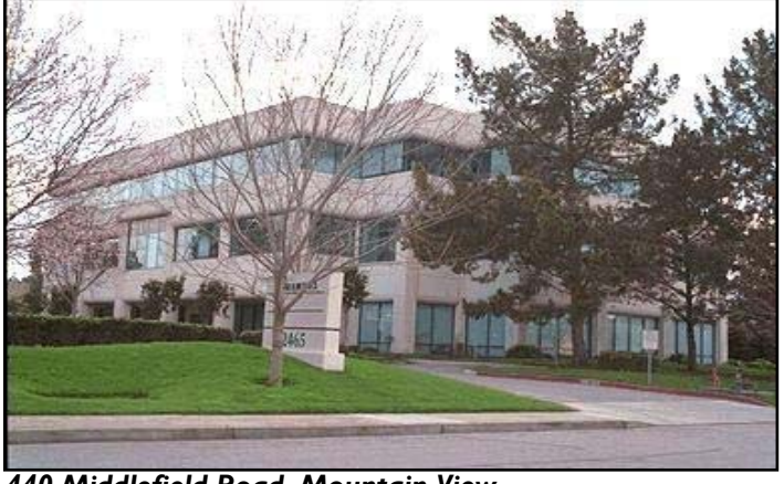
440 Middlefield Road, Mountain View

EHealthInsurance Services signed a short one year renewal for their space at 440 Middlefield Road