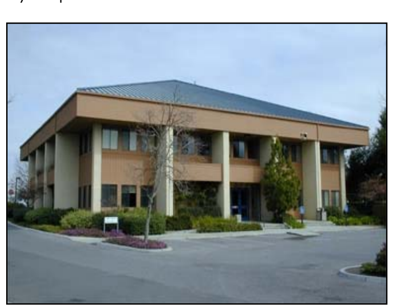
Landmark Office Center, Mountain View

Two buildings in the downtown market, 650 Castro Street and 800 W. El Camino, have been fully leased for several quarters but now have direct space available. There are also three large spaces available for sublease, ranging from 10,120 square feet at 444 Castro Street to another 17,589 square feet space at 303 Bryant. Although the asking rates on these spaces are lower than on direct spaces, they are not significantly lower because either the master leases were signed at a time when the rents were higher and the Sublessors are trying to recoup some of their costs or because the spaces are offered Plug & Play for a premium.