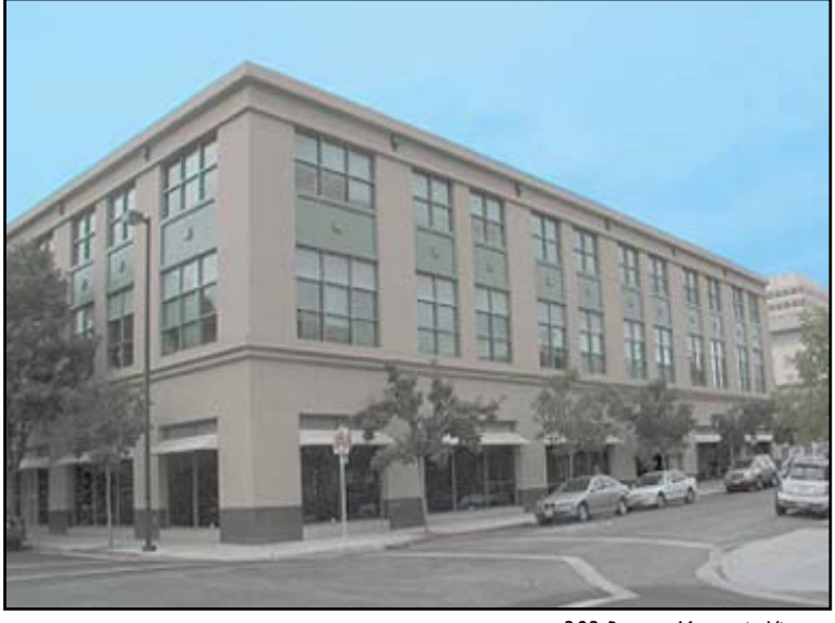
303 Bryant, Mountain View